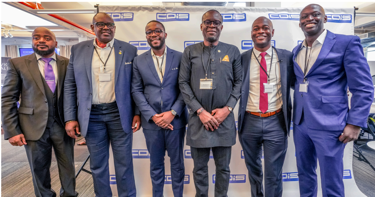
Congoese Diaspora Impact Summit, September 2019