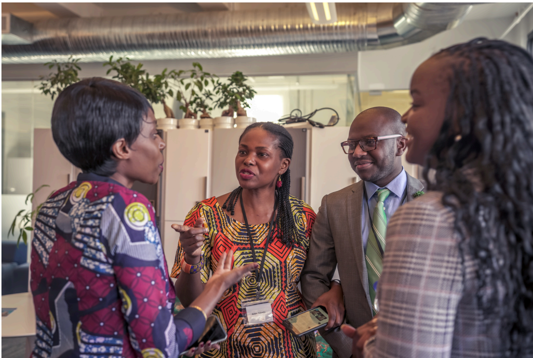
Congoese Diaspora Impact Summit, September 2019