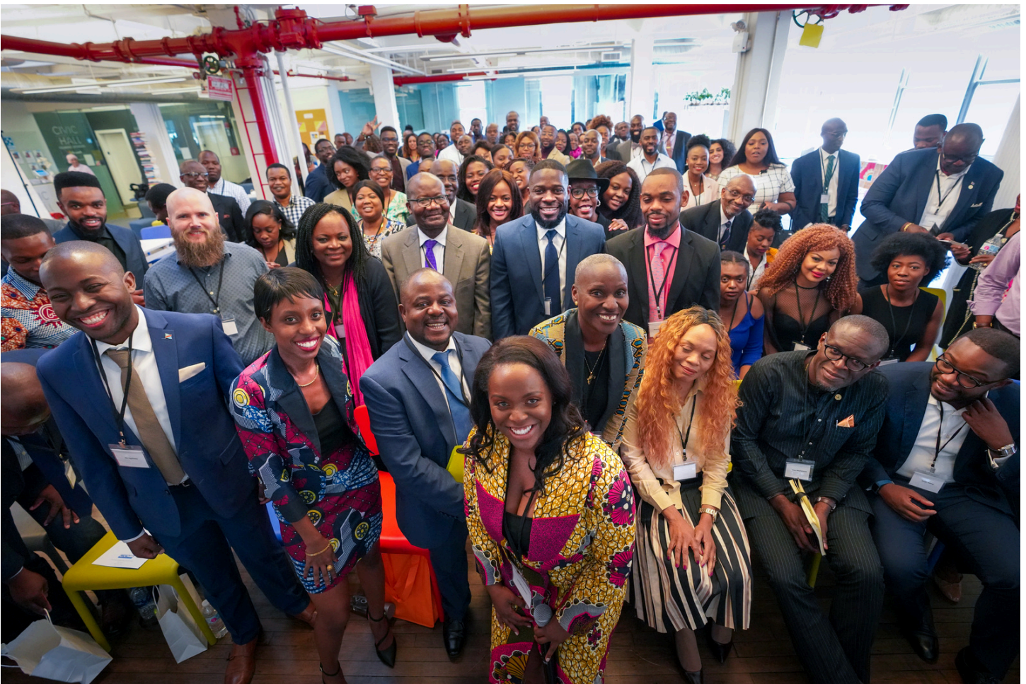
Congoese Diaspora Impact Summit, September 2019