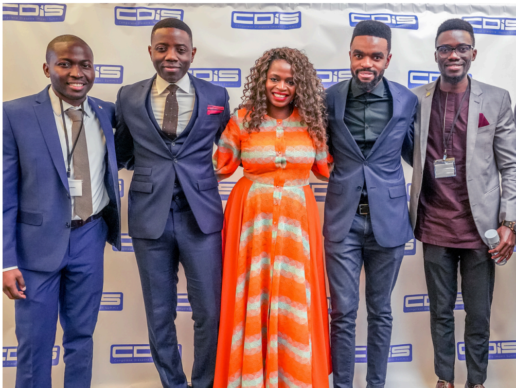
Photo: Kwame Andah, Congolese Diaspora Impact Summit, September 2019